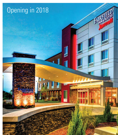
Opening in 2018